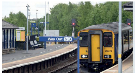
Image: Penistone railway station with Huddersfield bound train.

On 25 August ruling cabinet members met and agreed to back a plan to acquire a site at Lairds Way, Penistone, to then sell on to the South Yorkshire Passenger Transport Executive (SYPT). This could pave the way to create a park and ride facility at Penistone railway station. This would provide a parking solution and push plans to improve and utilize services, enabling more commuters to use the line and boost the local economy.