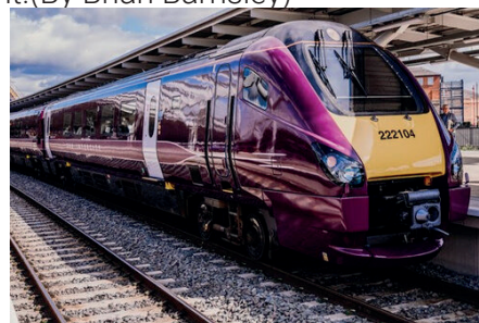
Image: East Midlands Rail boosts London links with new timetable.