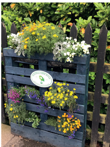
Image: Blooming pallet planters shortlisted for CRN award by CARE Group at Silkstone Common station

Station Adoption Group (CARE) have been shortlisted for their pallet planters. The group are very new to station adoption, and have made huge improvements at the station. Do look out for the planters when you next go through on the train, up-cycled pallets are a great idea for stations where space is tight! The Community Rail Awards are being held in Southampton in December 2021, we are hoping to attend in person! Do have a look on the Community Rail Network website for information on the awards.