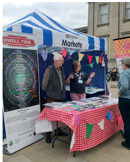
Image: Promotion stall St George's Square, Huddersfield at Big Knit Weekend.