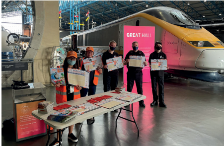
Image: Backtrack promotion at York Railway Museum.

Win a GoPro Bundle at backtrackcompetition.co.uk this year there are 7-11,12-17 and 18+ categories to submit anti-trespass messages through songs/raps, films, storyboards/ scripts. Enter by 11.59pm on 30 September 2021 entry details HERE!