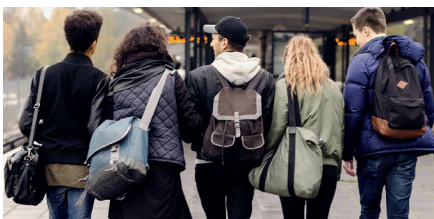
Image: Train taster sessions for young adults.

We love to create opportunity and show how to get the best out of train travel. Penistone Line Partnership have sessions planned for Autumn 2021 with Kirklees College. The day out on the Penistone Line will help with rail confidence for students with additional needs and learning difficulties. The young people currently attend courses in Adult Life Skills. We will also arrange a try the train session for learners studying English for Speakers of other Languages (ESOL). If your group could benefit from a Try the Train session please contact us at info@penline.co.uk