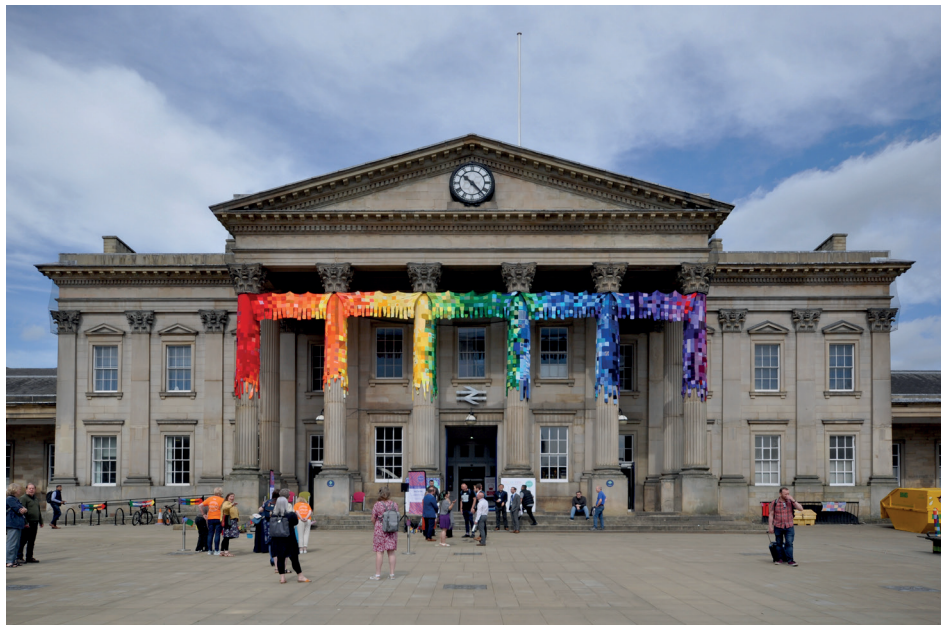
Image: Over 15,000 squares were knit and crocheted by people all over the world to yarn bomb Huddersfield Railway Station, for The Big Knit, part of the bi-annual Woven in Kirklees Festival.