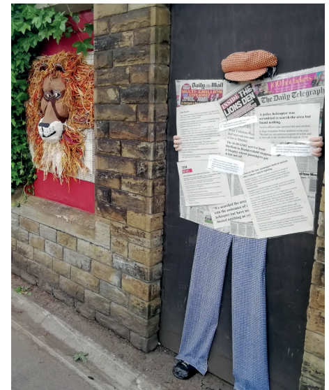
Image: Read all about the escaped lion! at Shepley Station for Woven in Kirklees.